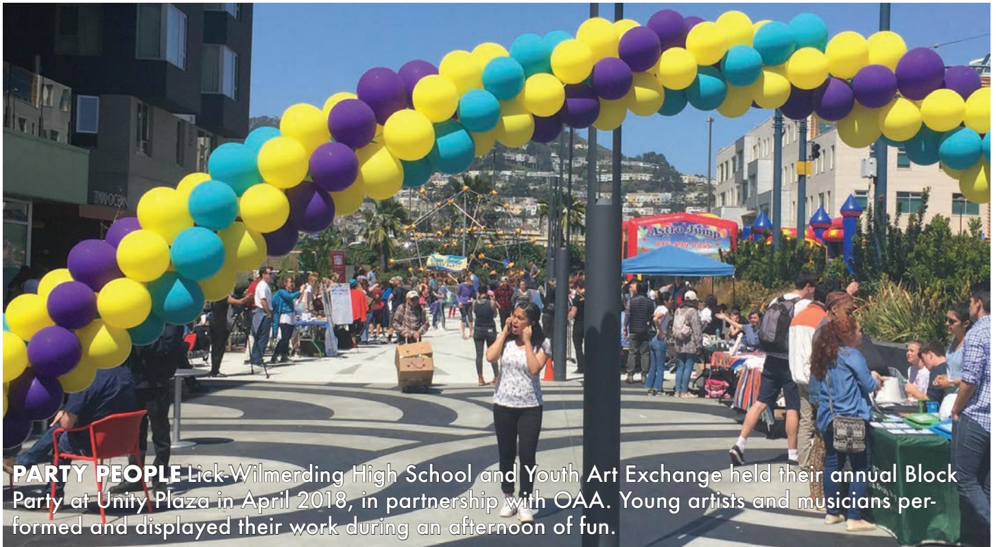
PARTY PEOPLE Lick-Wilmerding High School and Youth Art Exchange held their annual Block Party at Unity Plaza in April 2018, in partnership with OAA. Young artists and musicians performed and displayed their work during an afternoon of fun.